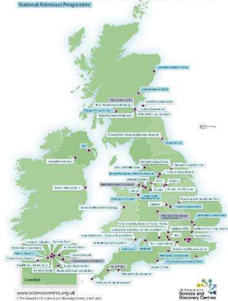
The Association for Science and Discovery Centres Network National Astronaut Programme

ASDC and partners created a bespoke set of space resources and equipment. We then selected and trained 20 UK science centres and museums to run these space activities, family shows and schools workshops across their regions